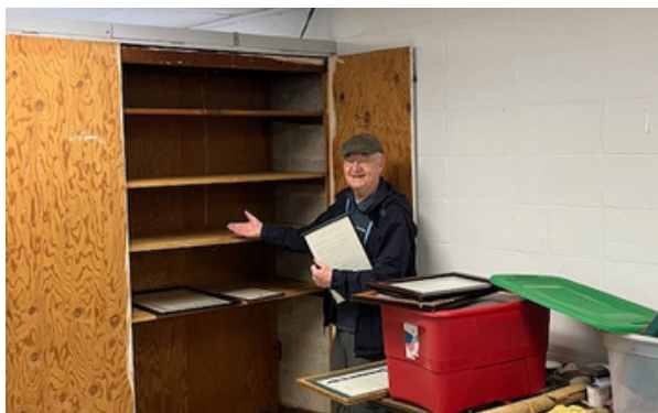
Emptied and soon to be gone