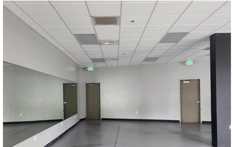
The empty space from the entrance, the head table will be at left in front of mirrors.

A crew of members moved furniture to the temporary space following the February 26 meeting. Pictured at right is the vacant space above, and the tables and chairs moved in and the crew below.