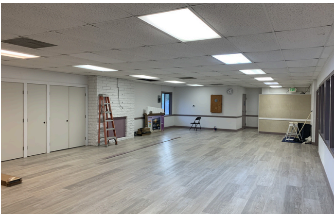
A look at the main room showing the new cabinets on left and partition at front door