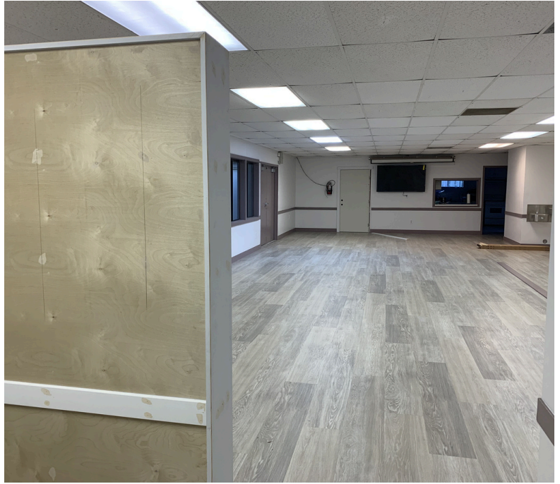
All appears in readiness for a return to the remodeled clubhouse in April. Note new partition and TV monitor