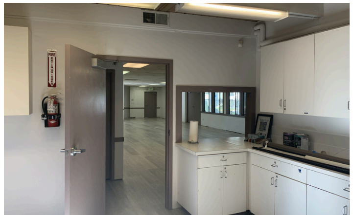
A view from the kitchen showing the new flooring in place